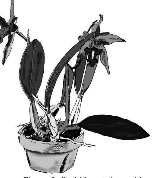
Figure 2. Orchid container with side slits for added drainage.

Drainage is one of the most important factors to consider when selecting containers for your orchids. Containers designed especially for orchids have slits down the side for added drainage (Figure 2). Some containers have drainage holes in the bottom of the pot. If these holes are too small, they can be enlarged. Clay and plastic are the most popular materials for