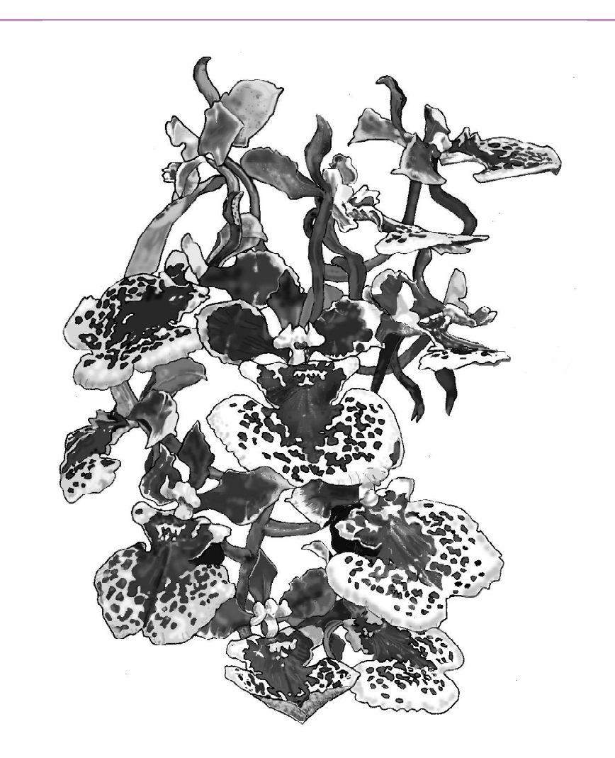
Figure 6. Oncidium or Dancing Lady Orchid.

Oncidiums are high-light orchids, requiring more than 2500 foot candles. Most Oncidiums perform best with one to several hours of sunlight daily, but plants with thick leaves can tolerate more light than those with thinner leaves. A bright south-facing window is ideal for these plants. To grow Oncidiums under artificial light, place four 40-watt fluorescent tubes supplemented with incandescent lights 6-12 inches above the plant. Metal halide and sodium-vapor bulbs can also be used, but they should be placed farther away from the plant. They prefer daytime temperatures in the 80s. Nighttime winter temperatures should be a minimum of 55F. Oncidiums require less humidity than many other orchids, ranging from 30 to 60 percent. Humidity levels in the home can be increased by placing the plants on waterfilled trays of gravel, or by placing a humidifier near the plant. Plants with thick, fleshy leaves need less frequent watering than those with thin leaves. All Oncidiums should be allowed to dry between watering. Thick-leaved Oncidiums can be grown on slabs of