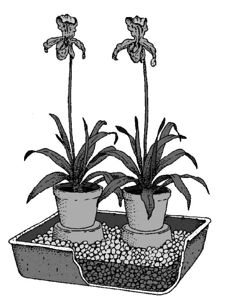
Figure 1. Increase the humidity surrounding a plant by placing it on a tray of gravel. Fill the tray with enough water to fill in the spaces between the gravel.

Orchids love humid conditions. They prefer a range of 50-70 percent relative humidity. There are several ways to increase the humidity in the orchid's environment. The simplest method is to place several plants close together to increase the humidity of the air surrounding the orchids. Plants can also be placed on travs containing a layer of pebbles or small gravel (Figure 1). Fill the tray with just enough water to fill the spaces between the gravel particles. The water in the gravel will increase the humidity. Never allow orchids to sit directly in water, since this can cause root disease. You can also increase the humidity by placing the plants in a bathroom window. by using plastic containers instead of clay pots, or you can