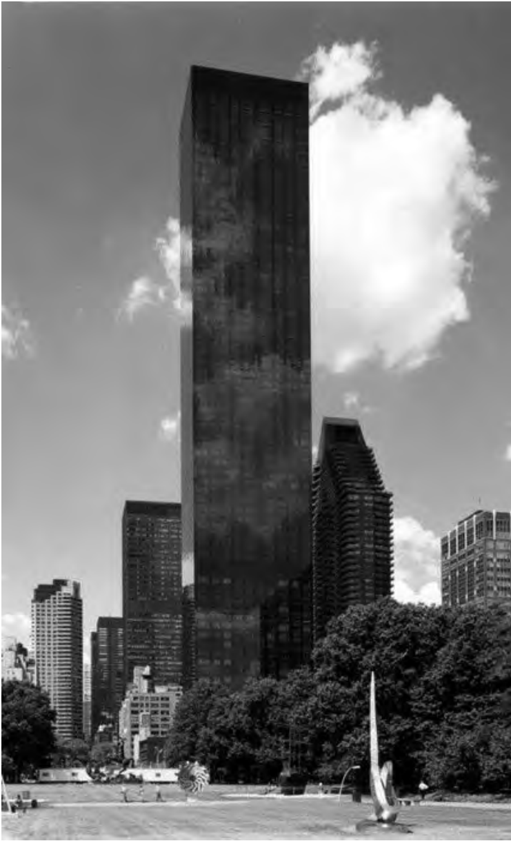
Trump World Tower at United Nations Plaza