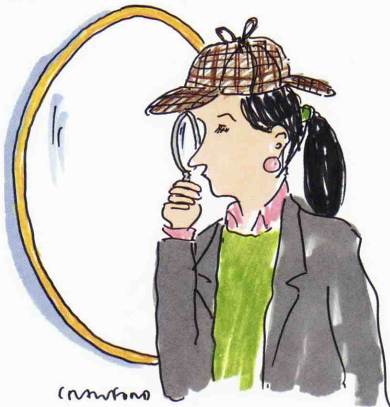
The professional who reasons productively casts a critical eye on her own role in a company's problem.

Manager: "Well, I certainly don't think you sound like you're whining. But two thoughts come to mind. If I understand you correctly, you were complaining, but the