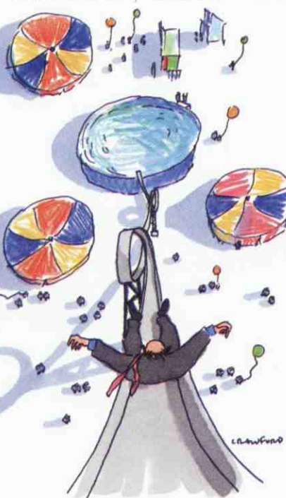
When professionals don't do their jobs perfectly, they zoom into a "doom loop."

Senior managers had identified six consultants whose performance they considered below standard. In