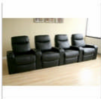
Home Theater Seating - 4 Piece Set in Black -