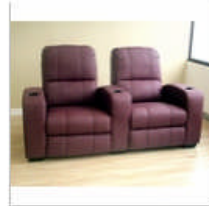
Home Theater Seating - 2 Piece Set in