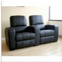
Home Theater Seating - 2 Piece Set in Black -