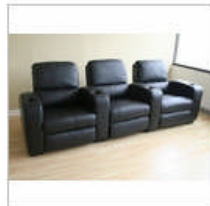
Home Theater Seating - 3 Piece Set in Black -