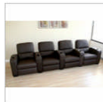
Home Theater Seating - 4 Piece Set in Brown