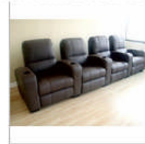
Home Theater Seating - 4 Piece Set in Brown