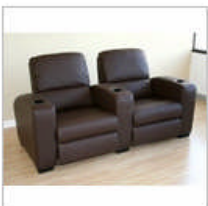
Home Theater Seating - 2 Piece Set in Brown