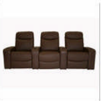
Home Theater Seating - 3 Piece Set in Brown