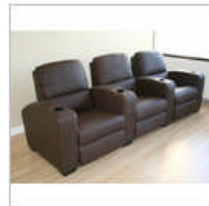
Home Theater Seating - 3 Piece Set in Brown