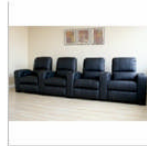
Home Theater Seating - 4 Piece Set in Black -