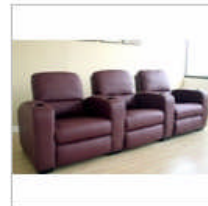
Home Theater Seating - 3 Piece Set in