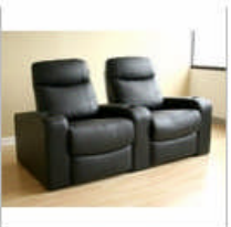
Home Theater Seating - 2 Piece Set in Black -