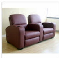
Home Theater Seating - 2 Piece Set in