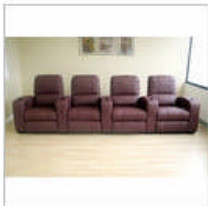
Home Theater Seating - 4 Piece Set in