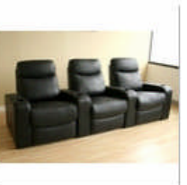
Home Theater Seating - 3 Piece Set in Black -