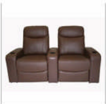
Home Theater Seating - 2 Piece Set in Brown