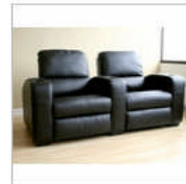
Home Theater Seating - 2 Piece Set in Black -