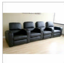
Home Theater Seating - 4 Piece Set in Black -