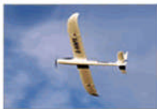
Electric RC Planes