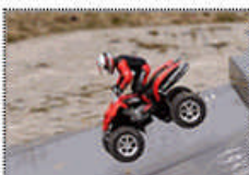
RC Stunt Cars