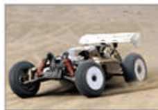
R/C Nitro Gas Car