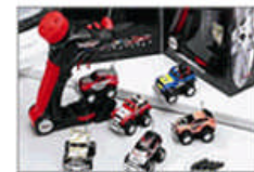
Mini RC Cars