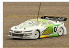
Electric R/C Cars